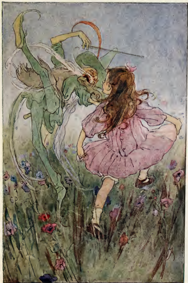
"I will accompany you" (p. 166).